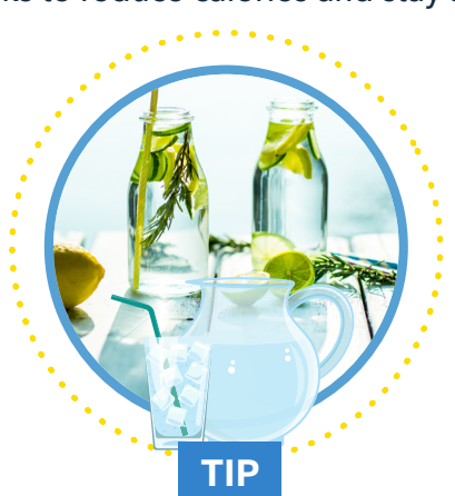
Add slices of fruit to water for a refreshing, low-calorie drink.

Drink water (fluoridated tap or unsweetened bottled or sparkling) instead of sugary or alcoholic drinks to reduce calories and stay safe.