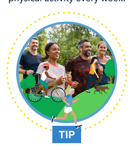
Physical activity has immediate benefits for your health: better sleep and reduced anxiety are two.

Get at least 150 minutes of aerobic physical activity every week.